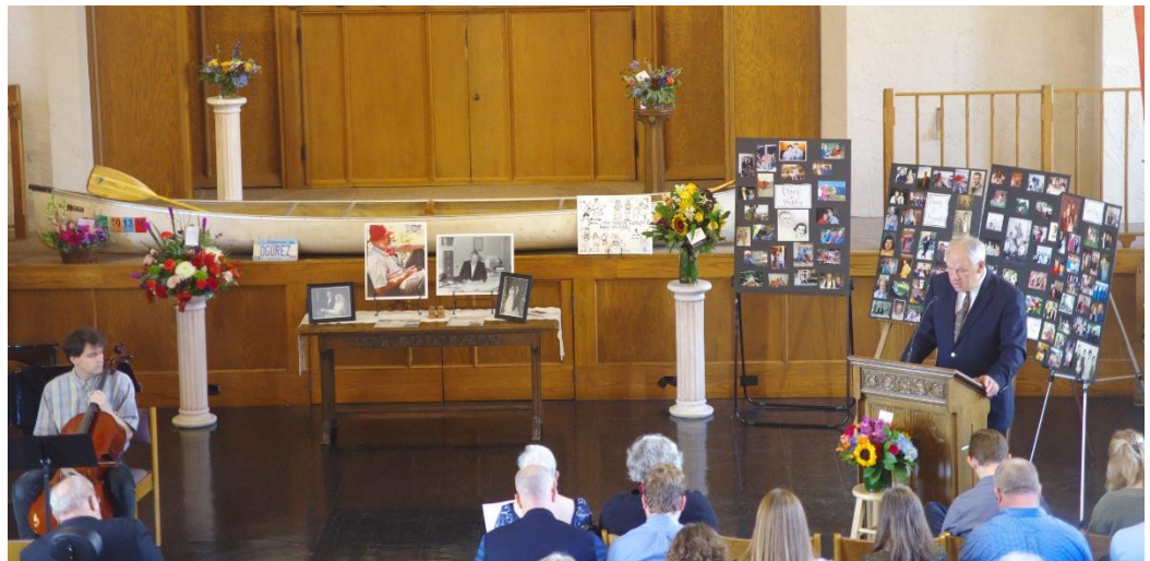
Photo boards, flowers and even Doug's canoe decorated the front of the sanctuary.