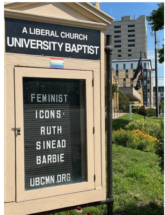
UBC front lawn sign.

Mediation Restorative Services and Conflict Resolution Minnesota aim to cultivate a community of practice to help us manage in a world where litigation and society are bogged down with disproportionate power dynamics in the court system, inequitable systems and policies, delayed outcomes due to limited resources, and limited control to change systems and policies. Here they make the case for faith involvement .