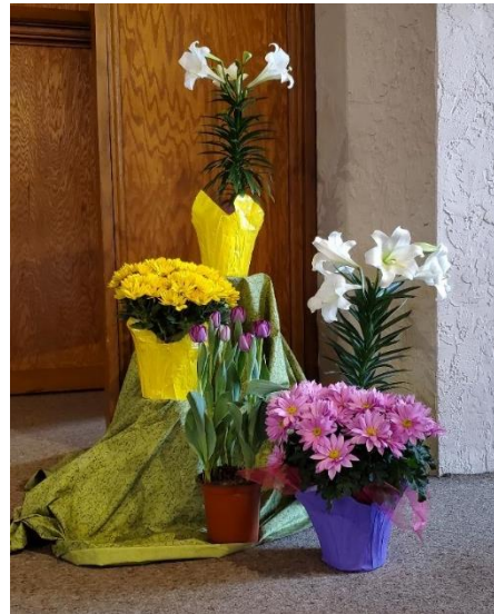
Spring flowers decorate the sanctuary for Easter.