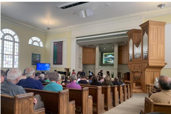
Oakhurst Baptist Church.