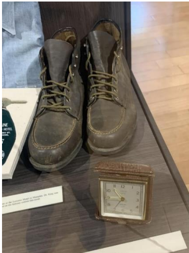
Martin Luther King, Jr.’s boots and travel alarm