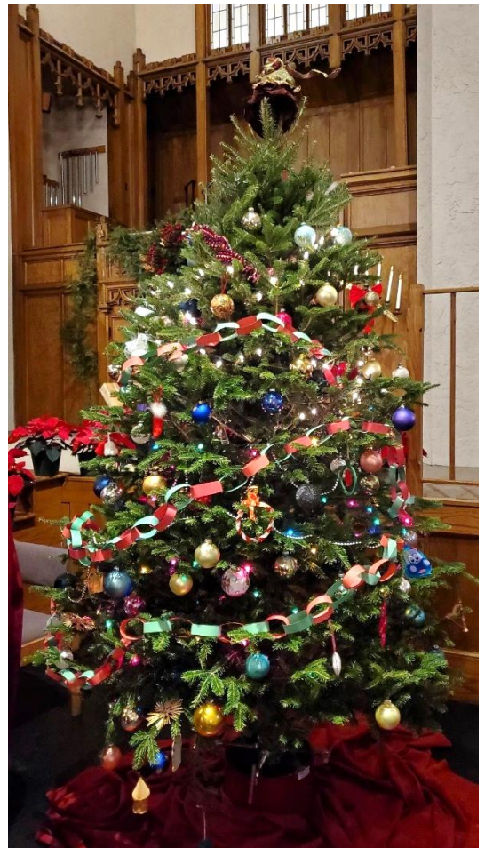
The fully decorated tree