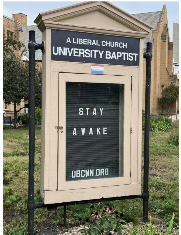
UBC sign.