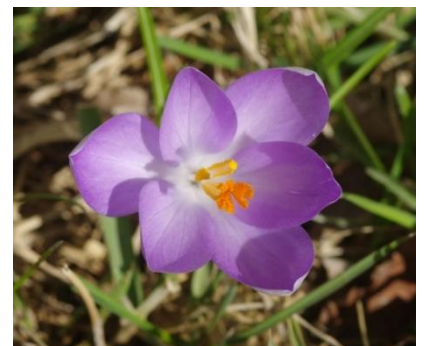
Crocus in the UBC Garden March 31, 2020.