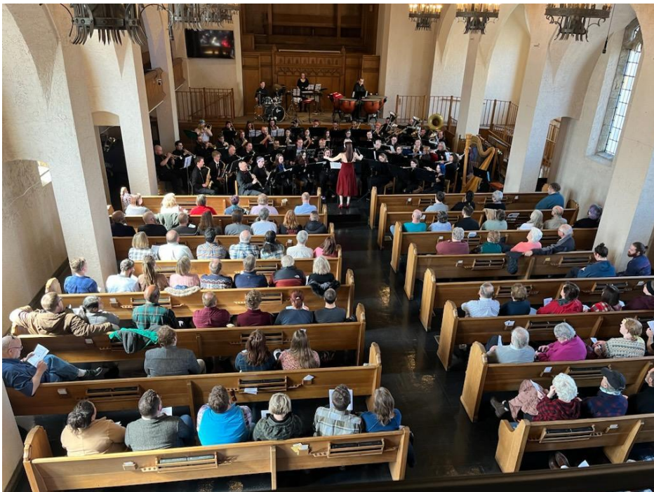
The Minnesota Freedom Band played to a full house in the UBC sanctuary on Mar. 19.