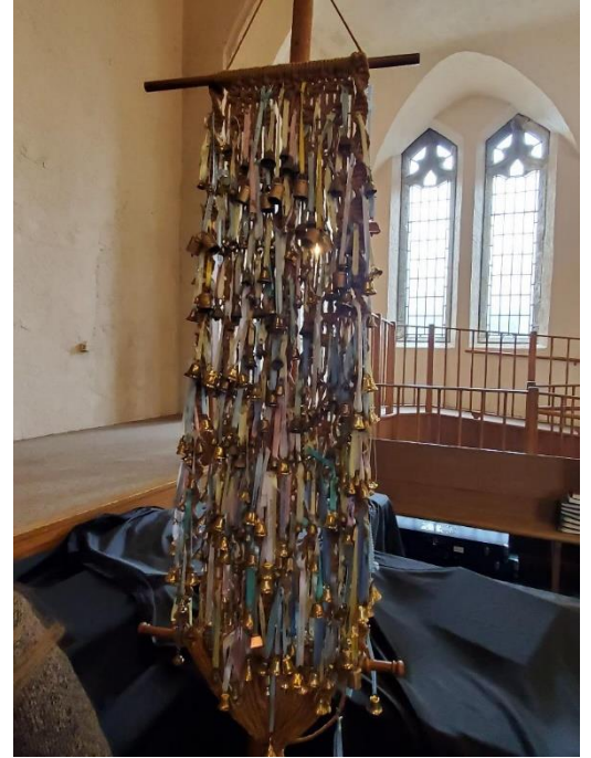
Bell banner of all the Saints who have passed.