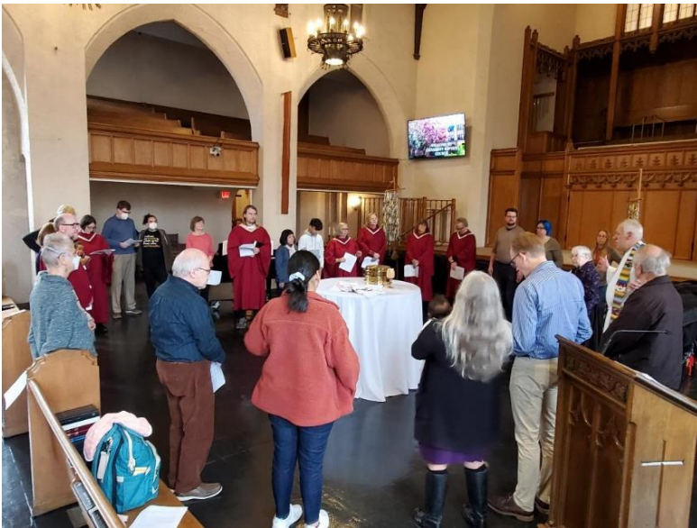
Congregants gathered around the table for communion during All Saints Sunday.